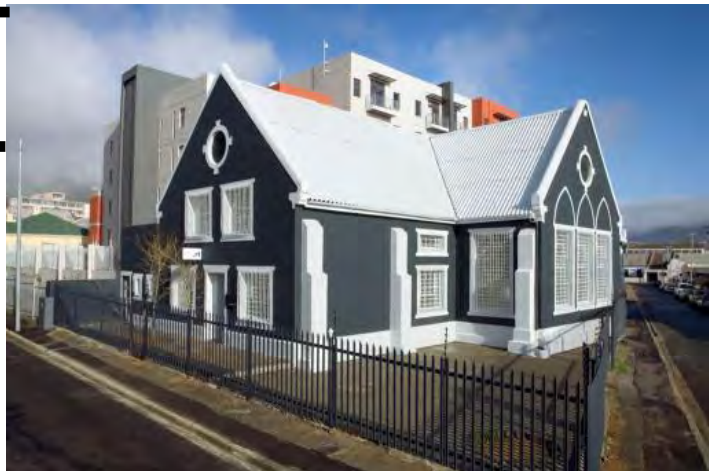
Imagem Inge Prins