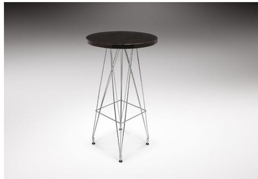
Weightless™ Round Bar Table