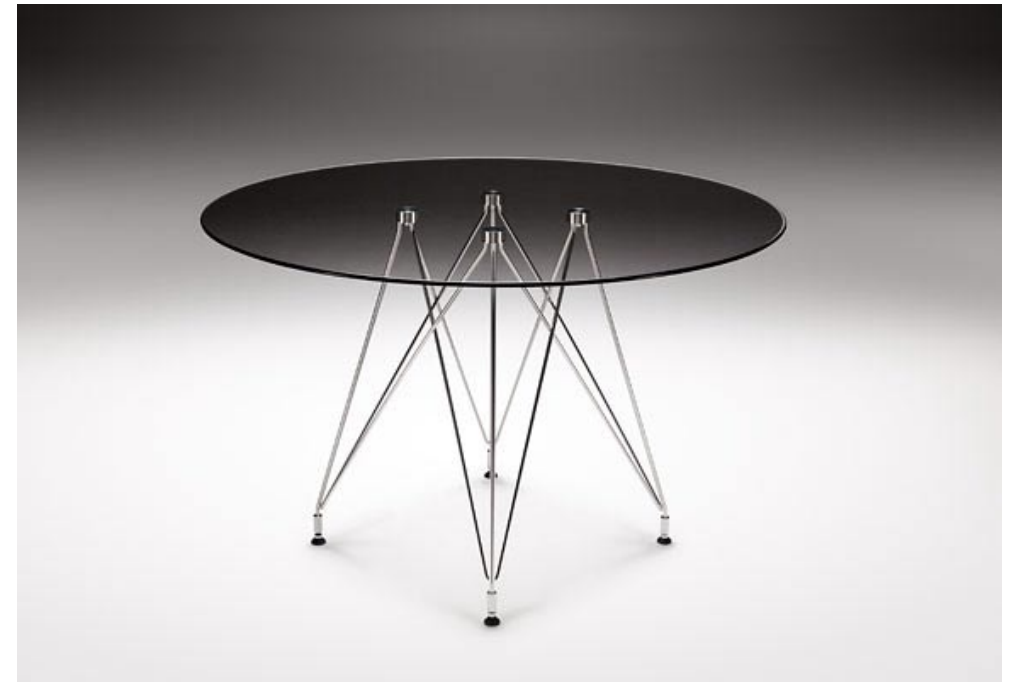
Weightless™ Round Table

Frame – Electropolished 304 Stainless Steel, Adjustable Feet